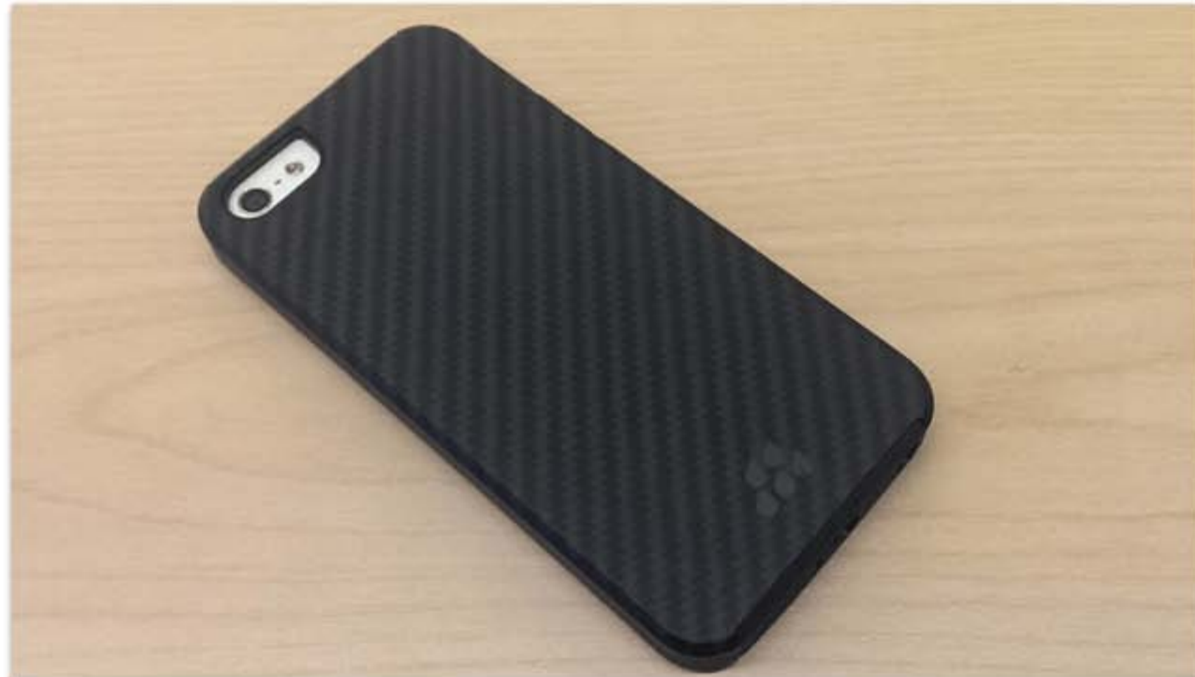
Created using strands of Kevlar this case is both beautiful and tough.

The Karbon SP cases are made from strands of Kevlar woven together to form different patterns that are then dipped to make the source material. This material is then shaped into these cases, which form the outer protective part of the case. On the inside there is a TPU case that protects the device against shocks and bumps.