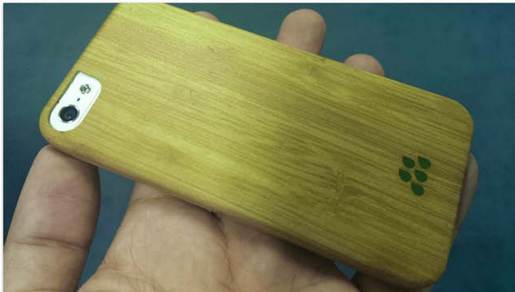
Evutec Wood S Series is a sleek looking but sturdy iPhone case.

The Wood S series is made up of several layers of real wood veneer and DuPont Kevlar fiber (Yes, it is really strong. Boasts to have 5 times the strength of steel on an equal-weight basis.) These layers are compressed together to form 0.9 mm thin sheets that are then shaped as cases and sprayed with a scratch-resistant coating.